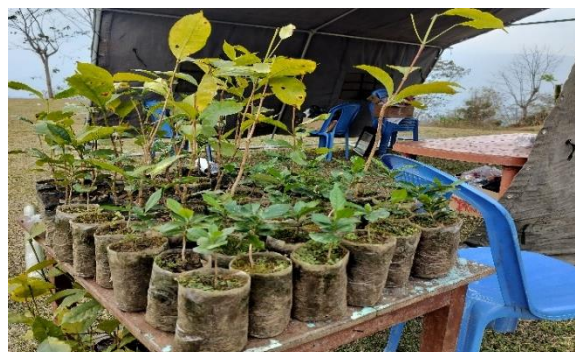
Figure 7: Coffee awareness during Chengu