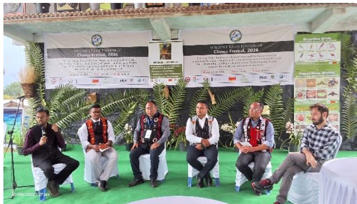
Figure 8: Panel discussion during Chengu

The discussion emphasized integrating livelihood improvement with conservation and climate finance opportunities.