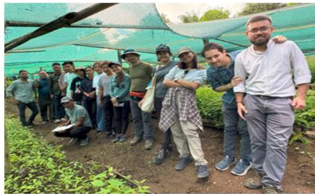
Figure 4: Nursery established in Sukhai