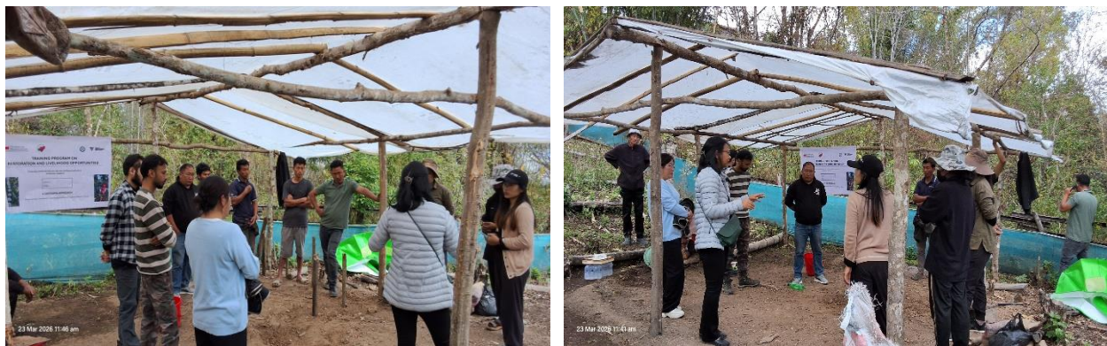
Figure 9: Nursery management training in Sukhai

In addition to this the KVK resource persons provided on-ground observations and recommendations. Specific suggestions were given to improve drainage systems and optimize pathway layout to enhance water flow and accessibility within the nursery. This hands-on engagement further strengthened the practical understanding of participants and supported improvements in the existing nursery setup. Attendance is attached in the appendix.