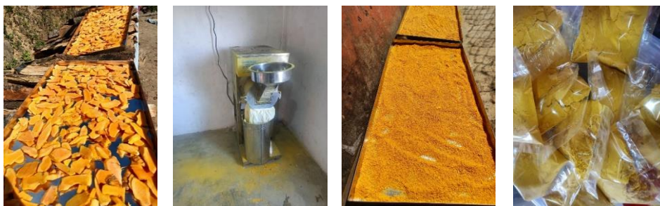
Figure 12: Existing turmeric processing available in Sukhai

Sites for turmeric plantation have also been identified in jhum agroforestry areas, leveraging existing land-use practices. These activities are being supported under the co-financing from the Mountain to Mangrove project, ensuring resource convergence and strengthening the overall livelihood intervention.