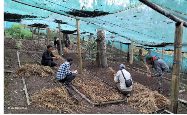
Figure 11: Coffee seed sowing at nursery in Sukhai