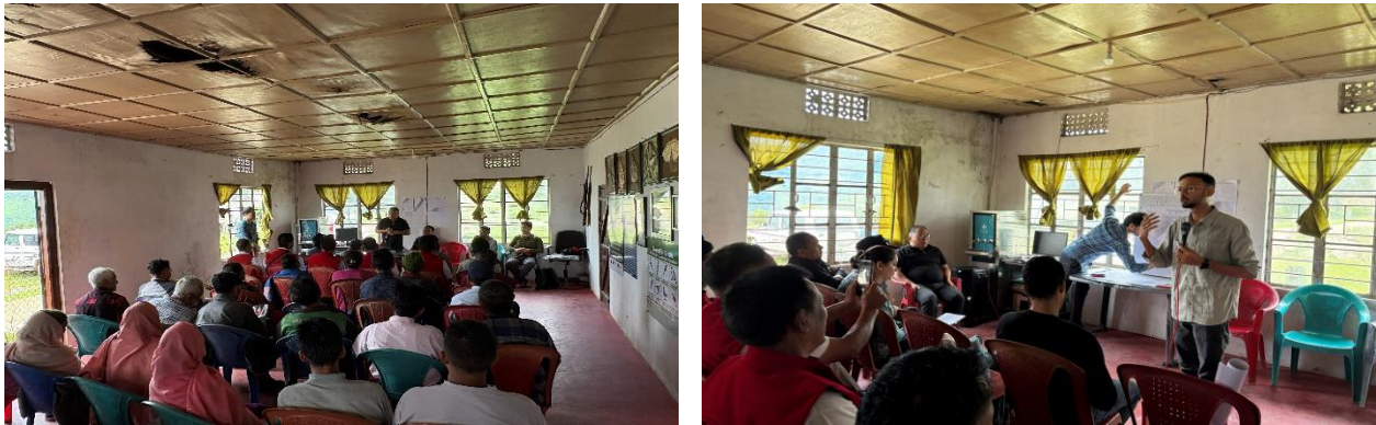
Figure 1: Inception Meet

programs will be organized to ensure effective implementation and sustainability of outcomes. The detailed agenda and attendance of the inception meeting is attached in the Appendix.