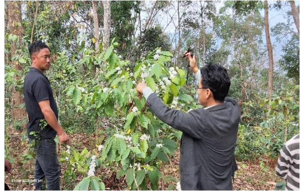
Figure 6: Coffee training - exposure visits