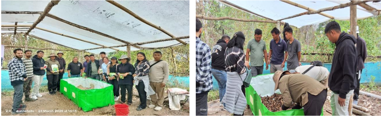
Figure 10: Vermicomposting training in Sukhai