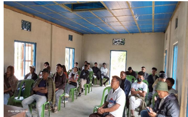
Figure 5: Coffee Training- Classroom session