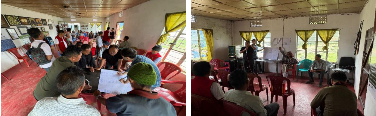
Figure 2: Need Assessment with community members