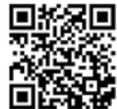
Recovery, Recycling and Reclamation